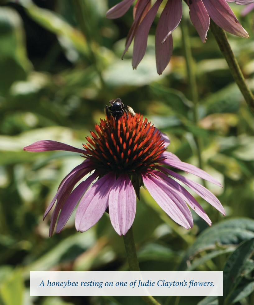
A honeybee resting on one of Judie Clayton's flowers.